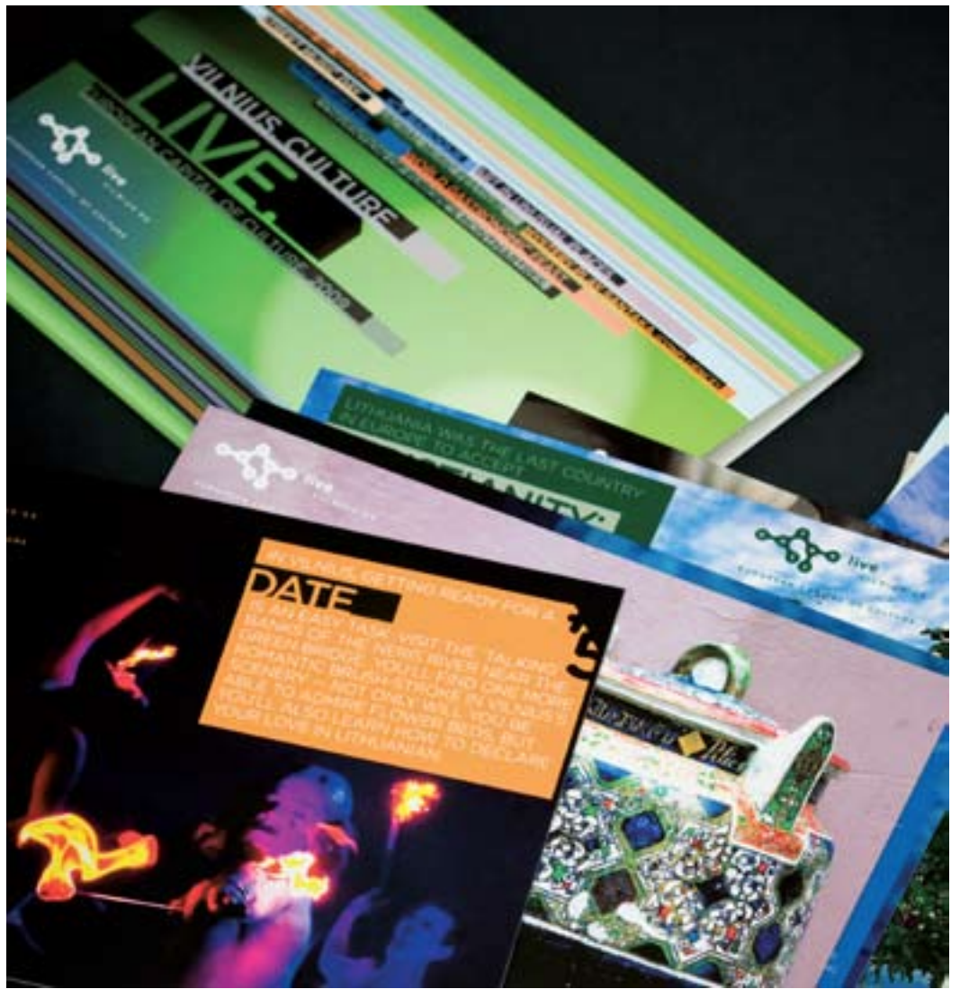
Set of postcards Client: "Vilnius - European Capital of Culture 2009" Design by Inga Pakstaite & Mindaugas Jokubauskas (Design studio "Fonografika")