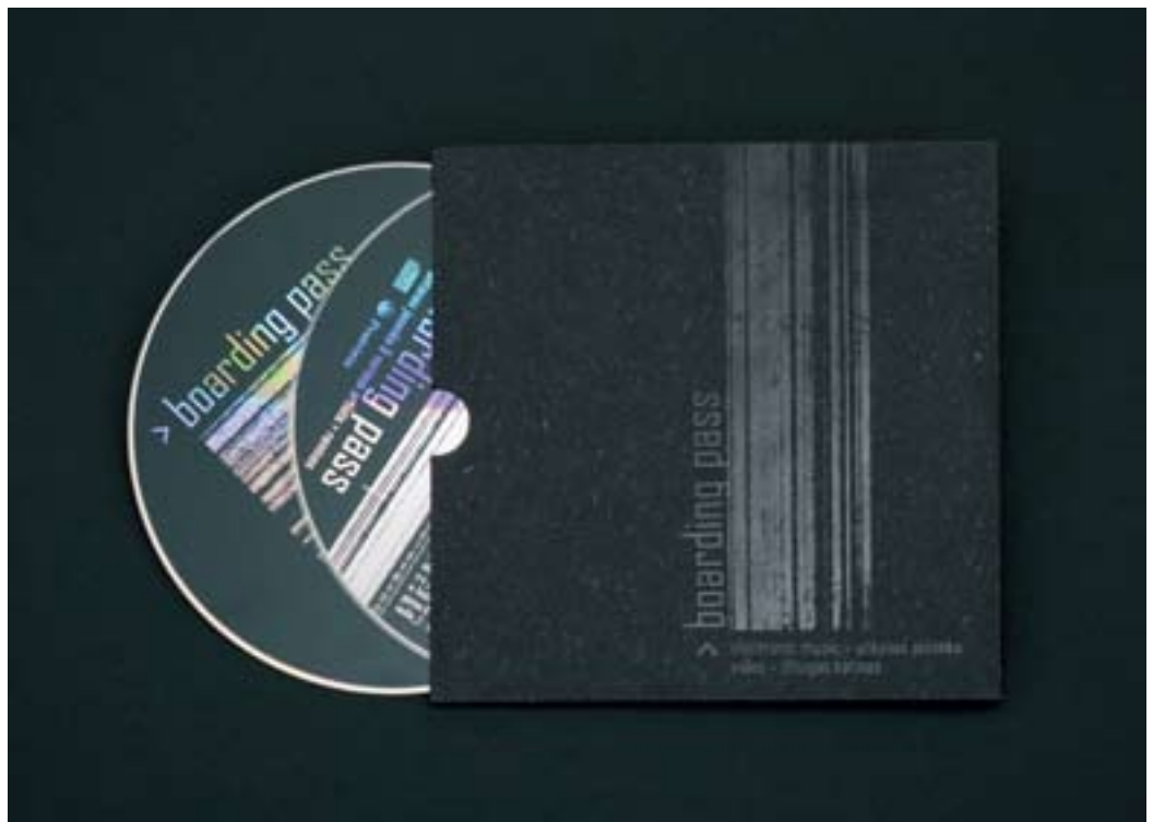
CD with Cardboard Sleeve Client: "Vilnius - European Capital of Culture 2009" Design by Agne Dautartaitė (Design studio "AD design")