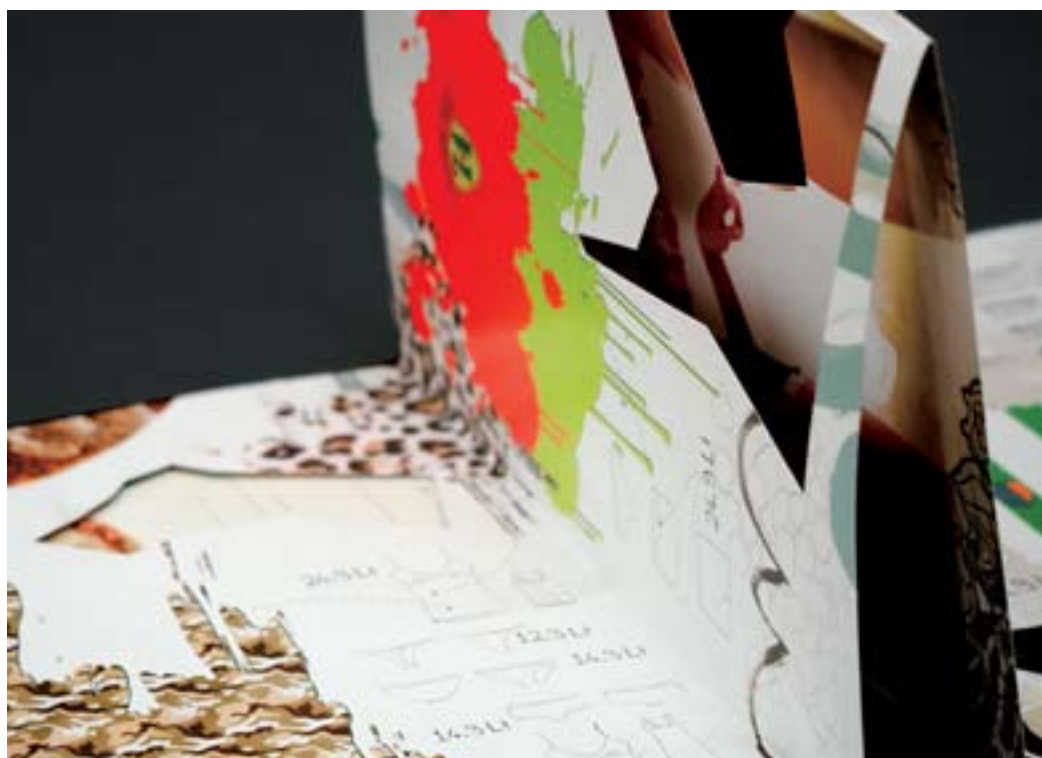
Promotional leaflet Client: "Effigy" Design by "Adell Taivas Ogilvy"