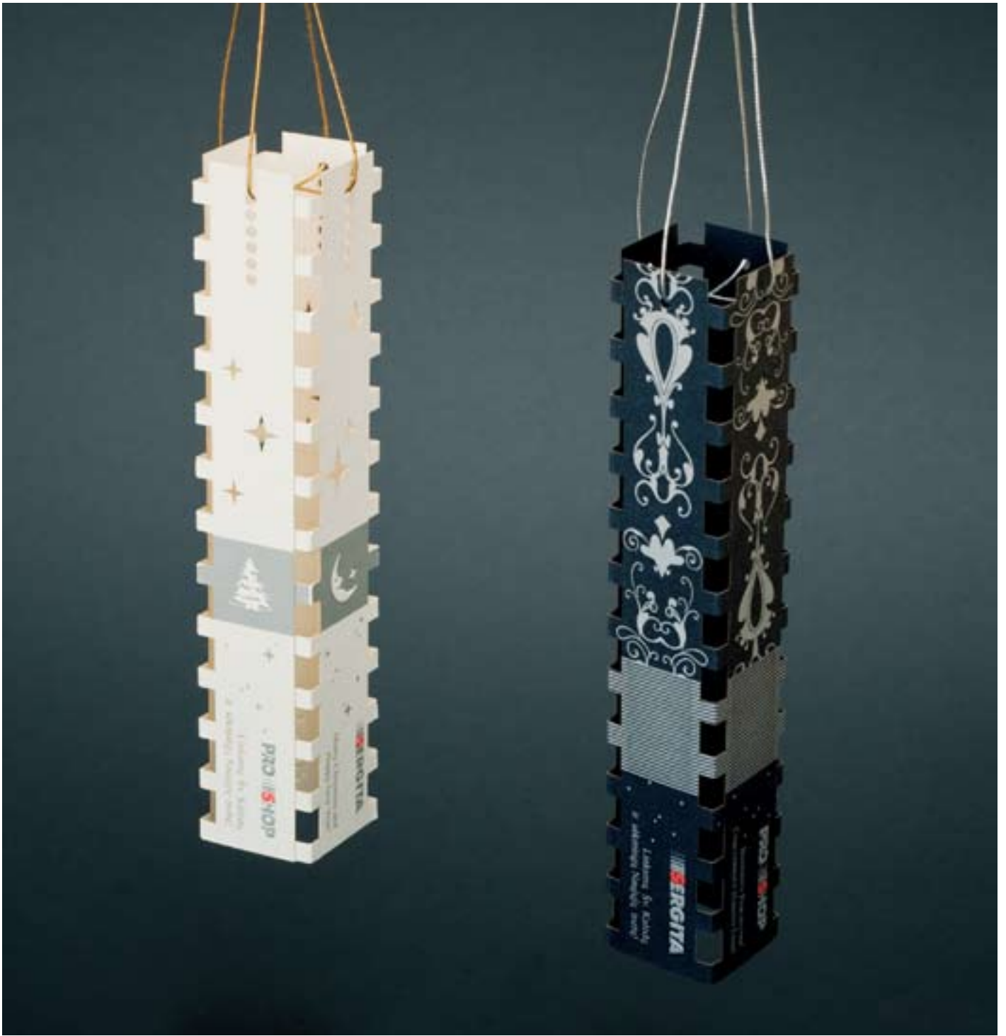
Christmas card Client: "Sergita" Design by "Tisena design"